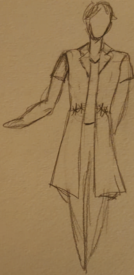
Enobriabus | Pompey